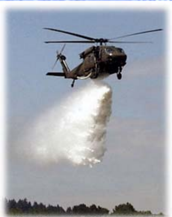
JFTB's Firehawk in action