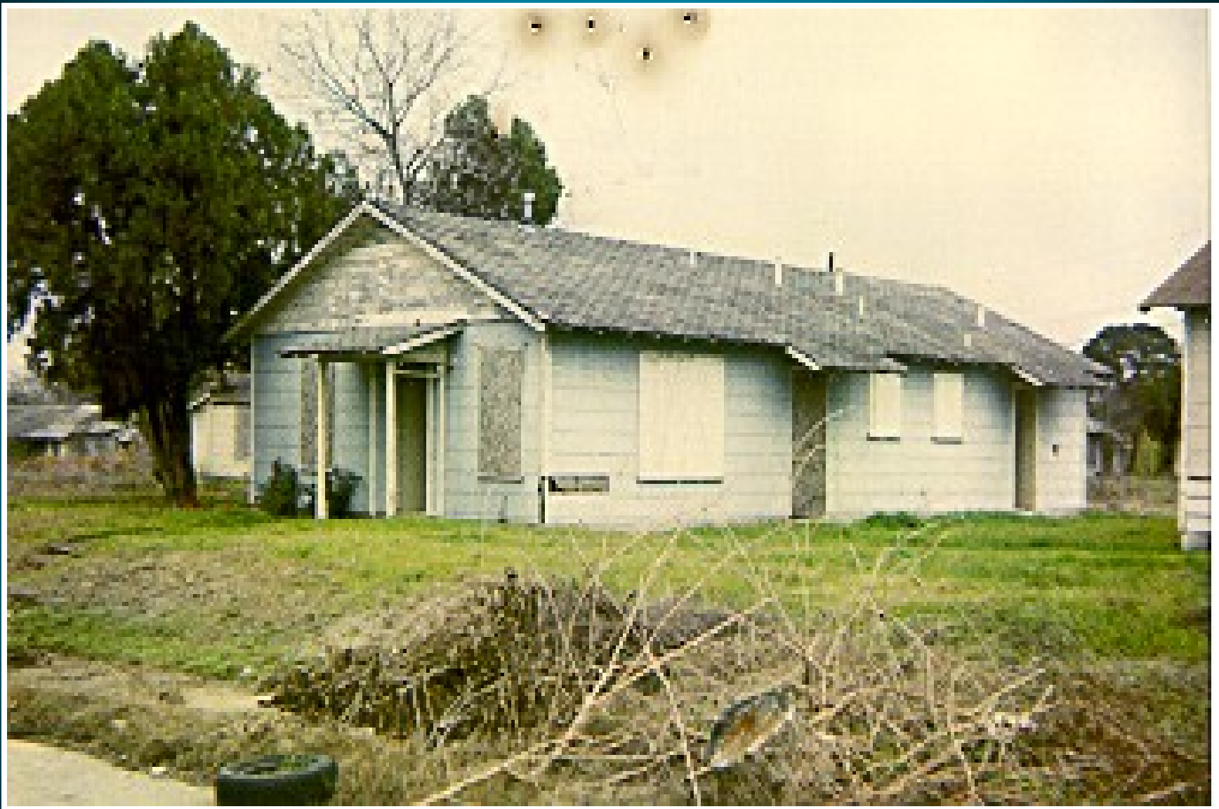
Coliseum Oak - San Antonio, TX..... Before