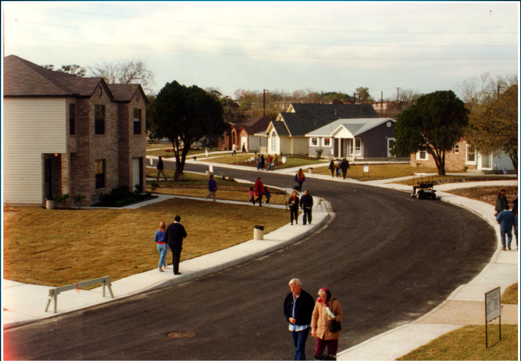
Coliseum Oak - San Antonio, TX..... After