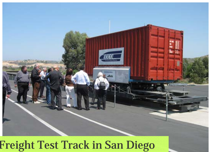
Board Members at the Maglev Freight Test Track in San Diego